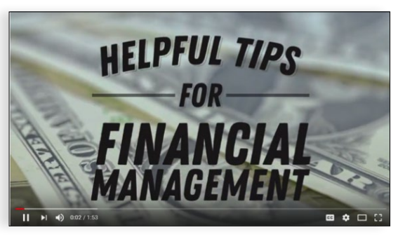
Marine Corps Community Service Miramar/ Marine Corps Recruit Depot, San Diego, Calif.