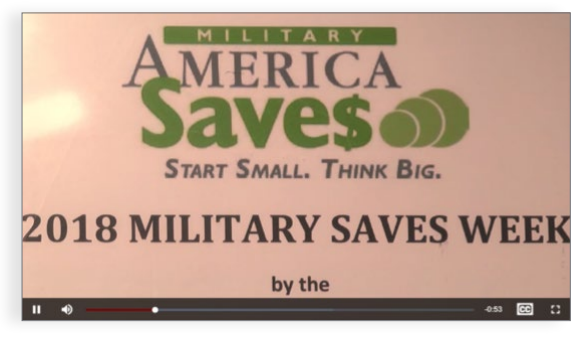
Goodfellow Air Force Base, TX